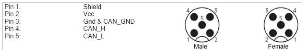
Figure 1: Layout CAN bus connector

Default: 2x 5-pins M12 connector (A-coding), female & male, loop-through. According to CiA303 V1.8.0