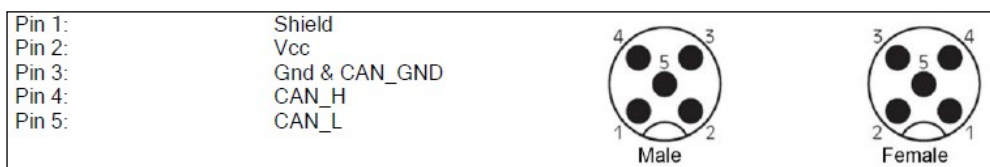
Figure 1: Layout CAN bus connector

Default: 2x 5-pins M12 connector (A-coding), female & male, loop-through. According to CiA303 V1.8.0